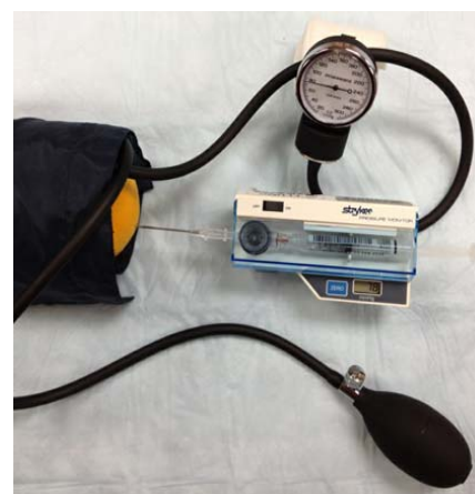
Figure 3. A simple Compartment Syndrome Model