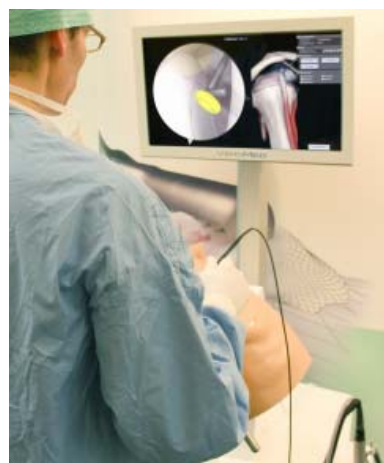
Figure 1. The VIRTAMED virtual reality arthroscopy simulator.

Most importantly, there is little data yet available on how effective these techniques are at improving surgical skills and ultimately surgical outcomes. Some preliminary data from general surgery does show that after simulation experiences PGY 1 residents can perform at the level of a PGY3 resident that has not had the simulation training. The more complicated VR systems can give significant feedback about how the surgeon has performed. It can show how much cartilage damage was done by the surgeon