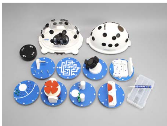
Figure 2. The Sawbones FAST Arthroscopy Training Workstation.

So it is very likely that future CME may involve surgical simulation or virtual reality. It may not be at this year's annual meeting in Kauai, but it will be there eventually.